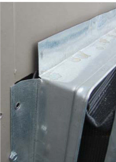
Something as small as an improper repair made to a supply-duct connection can create big problems. Fixing “small” issues often can make a difference on utility bills.

cally addresses the most obvious symptom, rather than the root cause of a problem. This approach usually focuses on the component, rather than system, level. For example, a contractor may simply adjust the thermostat or controller, while the real problem could be system fail-