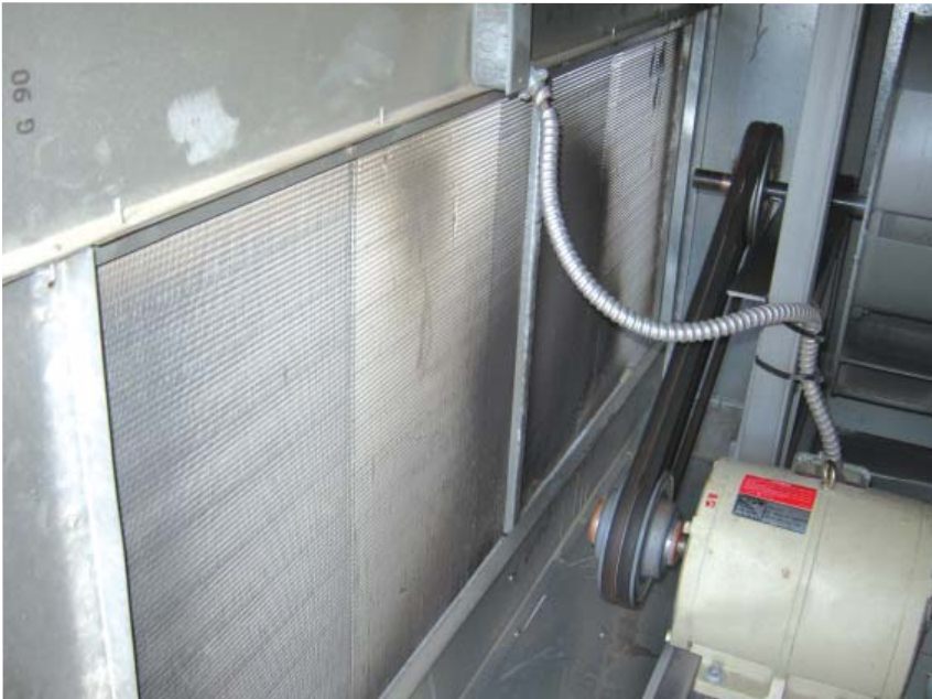
Deferred maintenance begins to impact system operation in subtle ways. For example, a worn pulley can cause rubber buildup on a coil.

cally addresses the most obvious symptom, rather than the root cause of a problem. This approach usually focuses on the component, rather than system, level. For example, a contractor may simply adjust the thermostat or controller, while the real problem could be system fail-